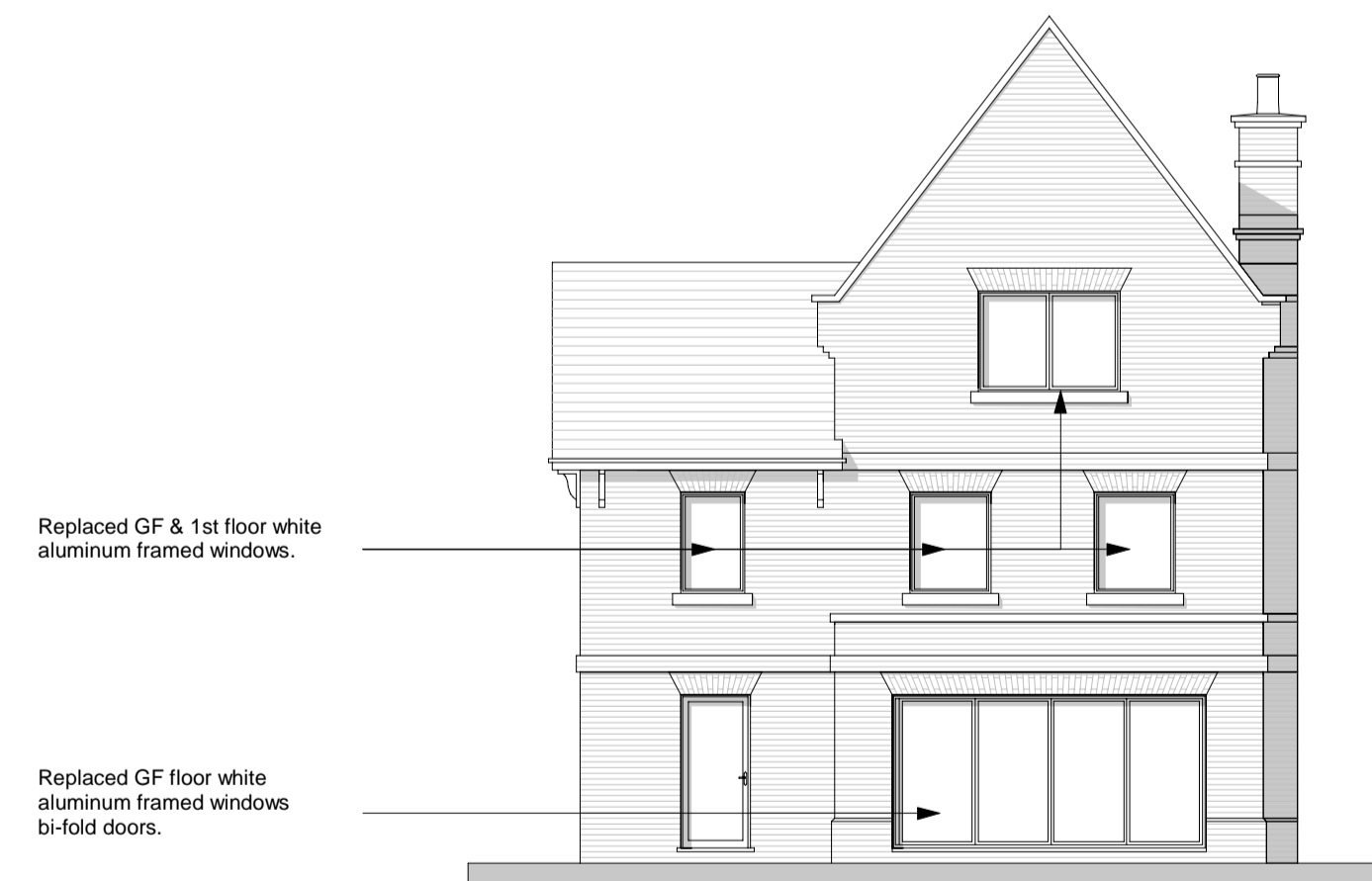
03 Proposed North West Elevation 02100 Scale 1 : 100