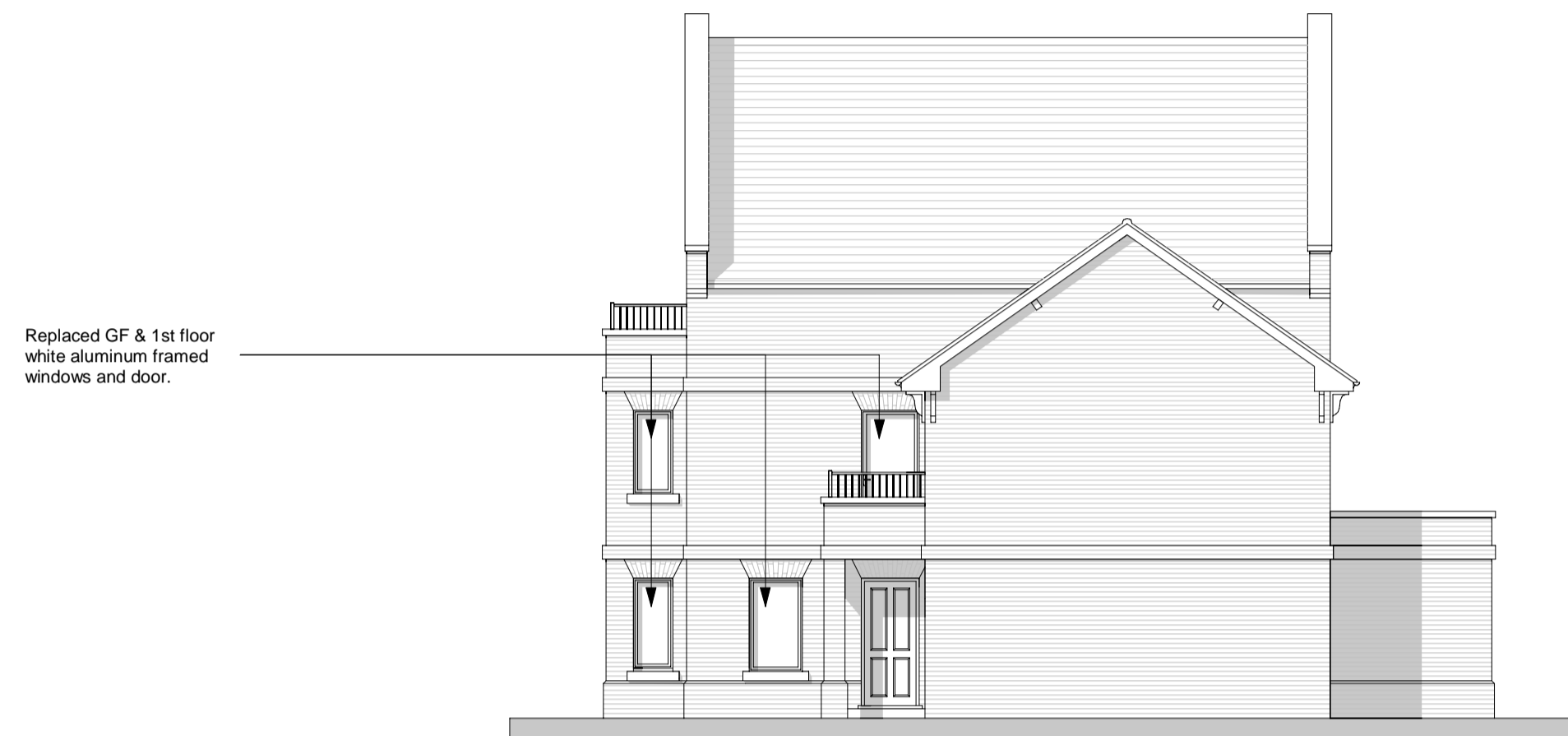
02 Proposed North East Elevation 02100 Scale 1 : 100